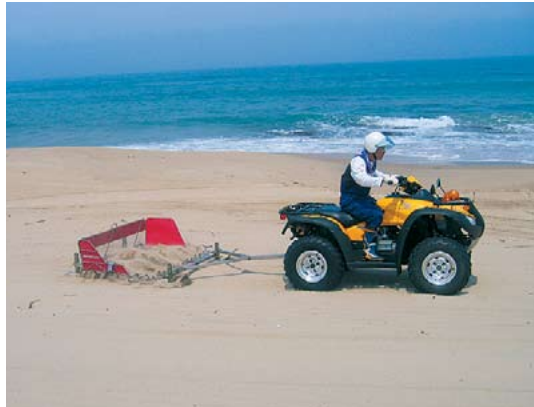
Honda's new Beach Cleaner in action clearing garbage from beaches in Japan. The campaign may soon expand overseas