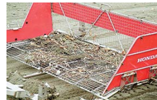
A simple yet ingenious towable sand screen separates litter from sand